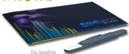
The GeneElite Test Kit.